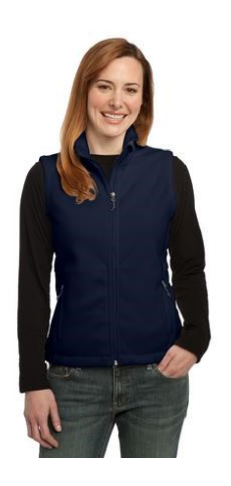
Port Authority® Ladies Value Fleece Vest Ladies #L219 / Adult #F219

Ready for layering, this super soft, midweight fleece vest offers great warmth at a great price.