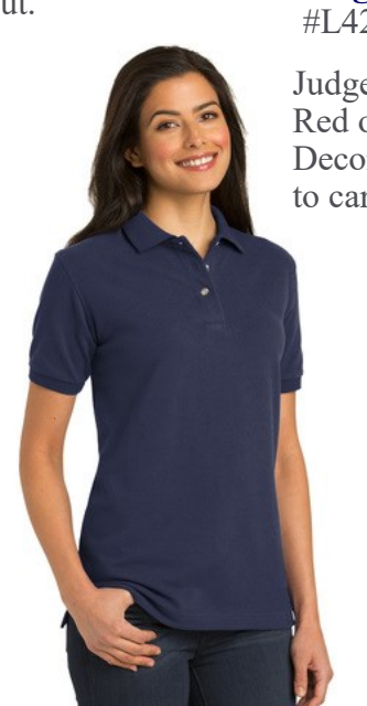
Port Authority Heavyweight Cotton Pique Polo #L420 Ladies / #K420 Mens

Judgement Farm color choice: True Navy Decoration: chest logo must add to cart at checkout.