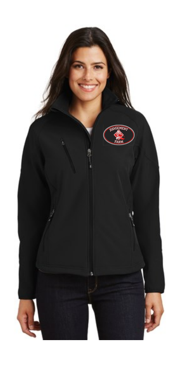
Textured Soft Shell Jacket #L705 Ladies #J705 Men's

Judgement Farm color choice: Black This garment is sold with both a chest and full back logo. It is necessary upon checkout you add both logos to your cart.