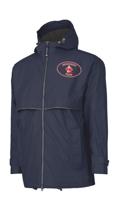
New Englander Rain Jacket - #9199 Men's / #5099 Ladies

Judgement Farm color choice: Navy Decoration: chest logo must add to cart at checkout