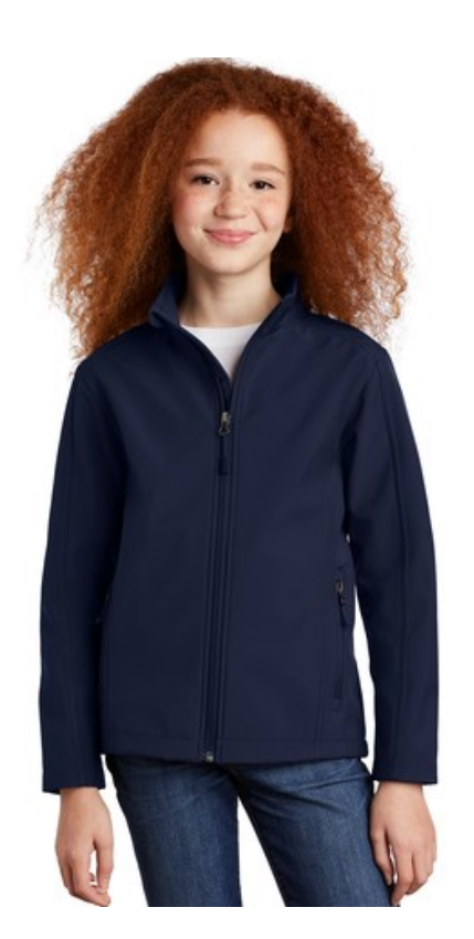
Port Authority® Youth Core Soft Shell Jacket #Y317