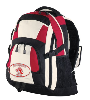
Urban Backpack - #BG77

Judgement Farm color choice: Red/Black/Stone Decoration: bag logo, must add to cart at check