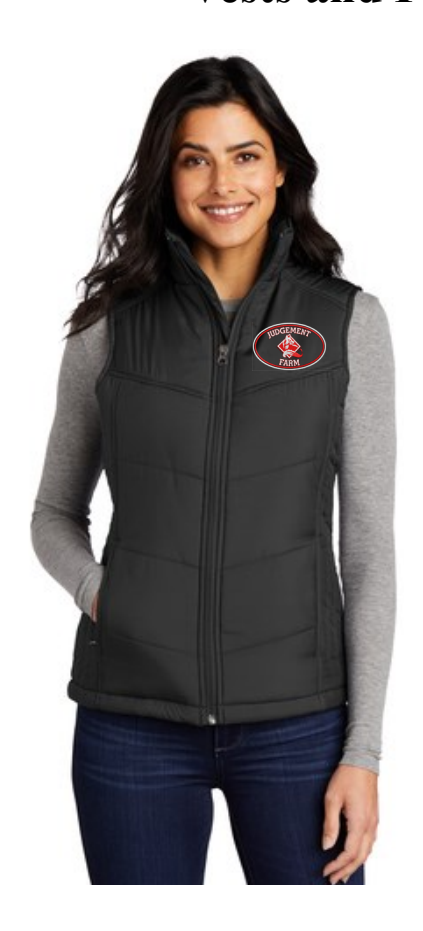
Port Authority® Puffy Vest Ladies #L709/Men's #J709

Judgement Farm color choice: Black Decoration: chest logo must add to cart at checkout