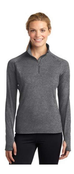
Sport-Tek® Ladies Sport-Wick® Stretch 1/2-Zip Pullover #LST850

Judgement Farm color choice: Charcoal Heather Decoration: chest logo, must add to cart at checkout